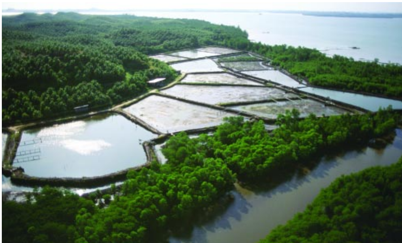
Figure 3. Oblique aerial view of a mangrove forest in Borneo, showing dikes and enclosed shrimp ponds carved out of the mangrove habitat.